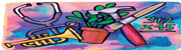
St John's Showcase 2018

St. John's Lutheran School Staff would like to thank everyone for making Teacher Appreciation Week special. Everyday special treats, word of kindness and sincere thanks was shared with the staff. We are truly blessed to be part of this wonderful church and school community.